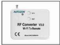
AZ RF WIFI 31 A Wifi Module