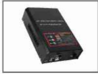
AZ RSDC 01 Controller