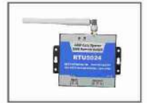
AZ GSM 30 GSM Module