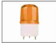
AZ AF LAC 19A Alarm Flash Lamp