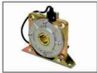
AZ RSSB 01 Safety Break