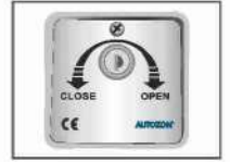
AZ KS 15 A Key Switch