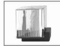
AZ FL 19 Flash Lamp