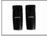
AZ PC 10 Photocell