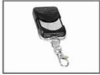
AZ RSDTX 02 Transmitter