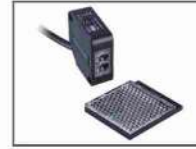
AZ RFPC 417M IP Reflector Photocell